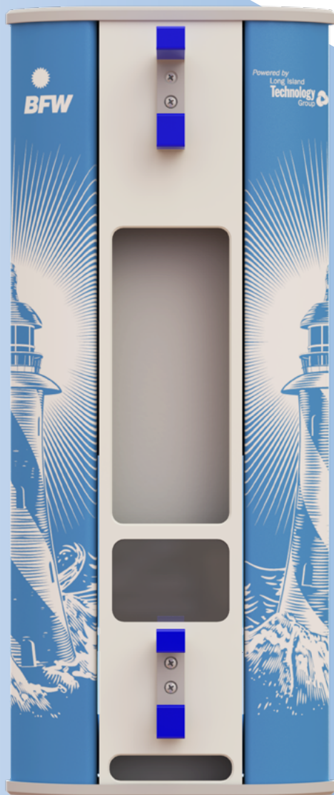
—BFW 5440 W2 —