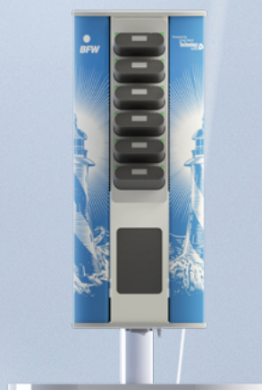
TABLE STAND CONFIGURATION

—BFW 9020 BC6 + BFW 5440 MR + BFW 5440 TDK + BFW 5440 BDK—